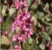
Cercis occidentalis (California Redbud)