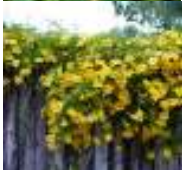
Macfadyena unguis-cati (Cat Claw Vine)