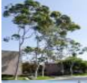
Eucalyptus citriodora (Lemon-scented Gum)