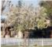
Pyrus kawakamii (Evergreen Pear)