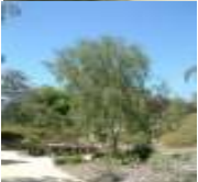
Geijera parviflora (Australian Willow)