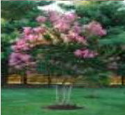
Lagerstroemia indica (Crape Myrtle)