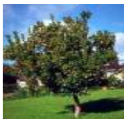
Arbutus unedo (Strawberry Tree)