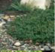
Arctostaphylos edmundsii (Little Sur Manzanita)