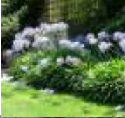
Agapanthus africanus (Lily-of-the-Nile)