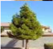
Pinus halepensis (Aleppo Pine)