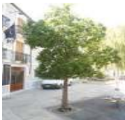
Brachychiton acerifolius (Bottle Tree)