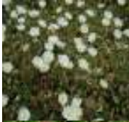
Cistus salvifolius (White Dwarf Rockrose)