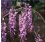
Wisteria spp. (Wisteria)