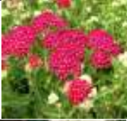
Archillea millefolium (Common Yarrow)