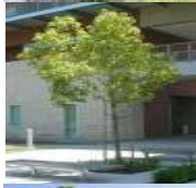
Cinnamomum camphora (Camphor Tree)