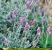
Lavandula dentata (French Lavender)