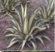
Agave americana (Century Plant)