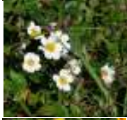
Fragaria chilolensis (Wild Strawberry)