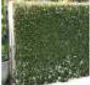
Ficus pumila (Creeping Fig)