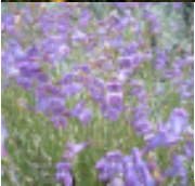
Penstemon palmeri (Beard Tongue)