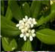
Pittosporum sp. (Pittosporum)