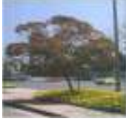
Eucalyptus torquata (Coral Gum)