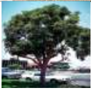
Tristania conferta (Brisbane Box)