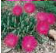
Cephalophyllum 'Red Spike' (Red Spike Ice Plant)