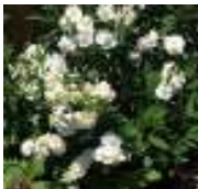
Carpenteria californica (Bush Anemone)