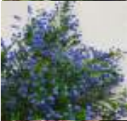
Ceanothis 'Concha' (California Lilac)