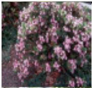
Raphiolepis indica (Pink Indian Hawthorn)