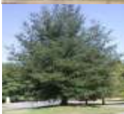
Quercus agrifolia (California Live Oak)