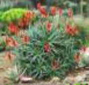
Aloe species (Aloe)