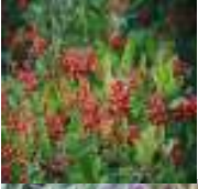
Heteromeles arbutifolia (Toyon)