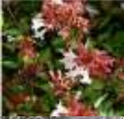
Abelia grandiflora (Glossy Abelia)