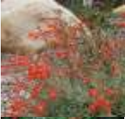
Epilobium canum/califonica (California Fuchsia)