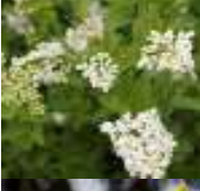
Ligustrum (Privet Species)