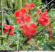
Caesalpinia pulcherrima (Red Bird of Paradise)