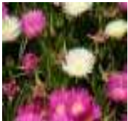
Carpobrotus edulis (Ice Plant, Hottentot Fig)