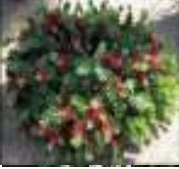
Callistemon citrinus (Dwarf Bottle Brush)