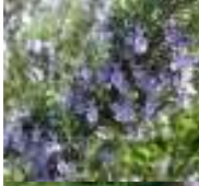
Rosmarinus officinalis (Rosemary)