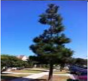
Pinus canariensis (Canary Island Pine)