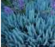
Senecio serpens (Blue Chalk Fingers)