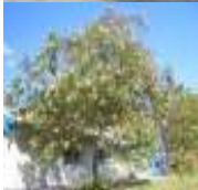
Chitalpa tashkentensis (Chitalpa)