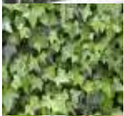
Hedera helix (English Ivy)