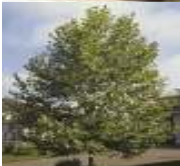
Platanus acerifolia (London Plane Tree)