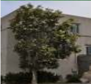
Melaleuca quinquenervia (Cajeput Tree)