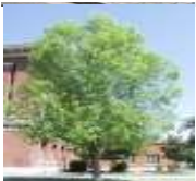
Fraxinus velutina (Arizona Ash)