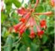
Lonicera sempervirens (Trumpet Honeysuckle)