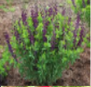
Amorpha canescens (False Indigo)